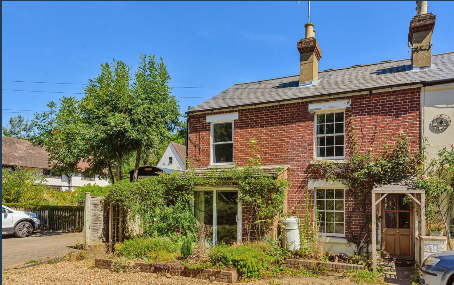
Puttocks Cottages Withies Lane, GU3 1JB